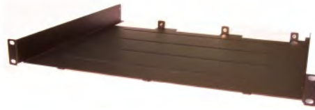
1RU rack mount tray (holds up to 3 NOVUS-RD)